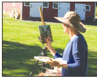
Plein Air Painter

Play with Clay Ceramic Studio Art Classes with Debbie Limoli: Thursdays, 7-9 pm or by appointment. $60 for 2 classes. For more info & to schedule, call 908 705 2266 or email customcrittersbydeb@yahoo.com .